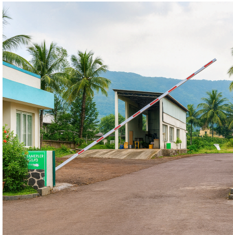
Single & Double Boom Barriers