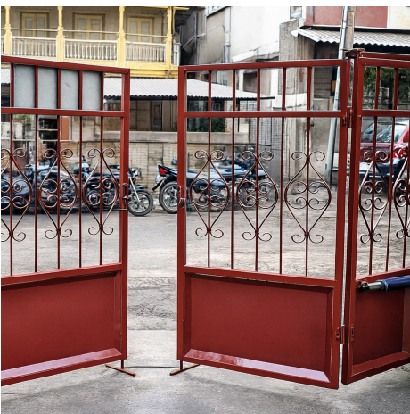
Double Swing & Folding