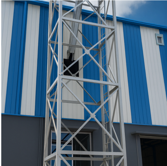
Custom Built Transfer Lift