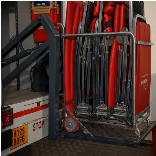
Structural Supported Lift