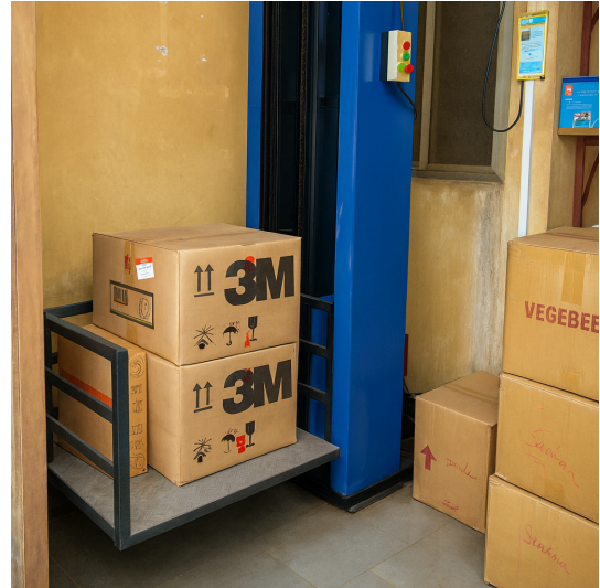
Self Standing Lift