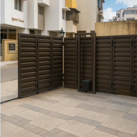
Sliding & Folding Gate